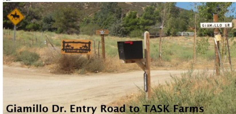
Giamillo Dr. Entry Road to TASK Farms